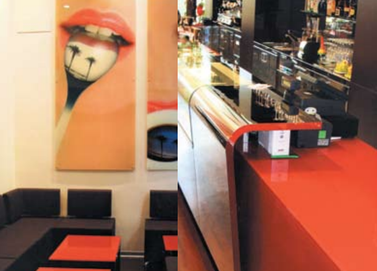
Restaurants & Bars