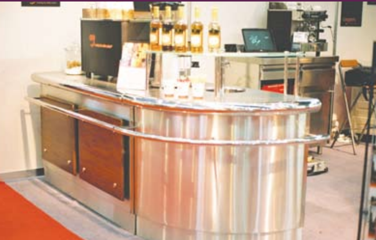
Cafes / Coffee Shops & Delis