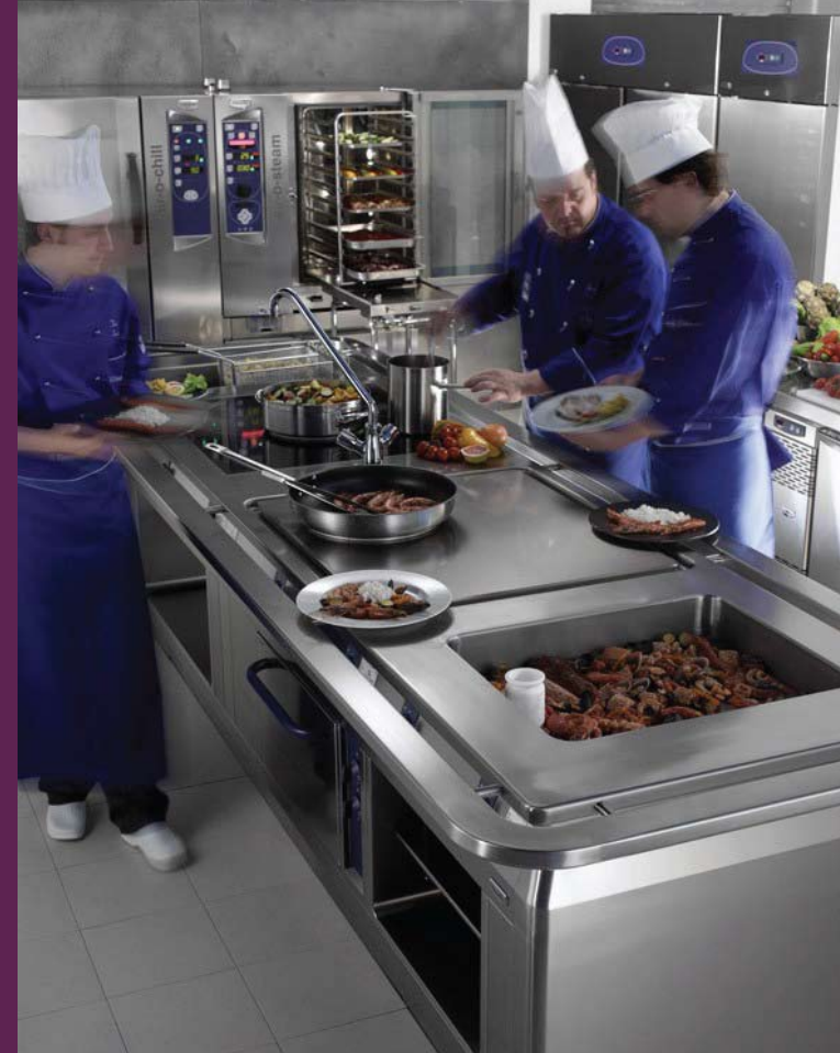
Hotel & Restaurant Kitchens