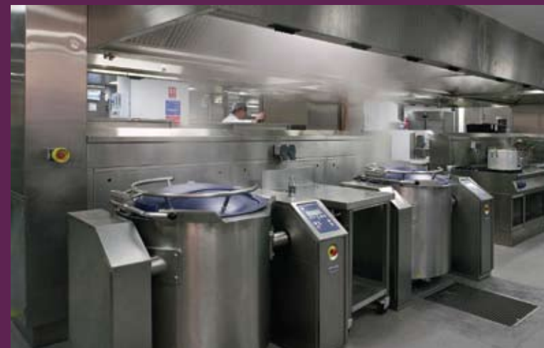
Hospitals, Universities & School Kitchens