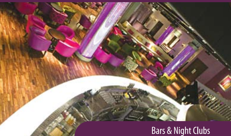
Bars & Night Clubs